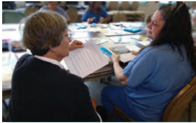
Volunteers coach participants throughout the writing and illustration process.